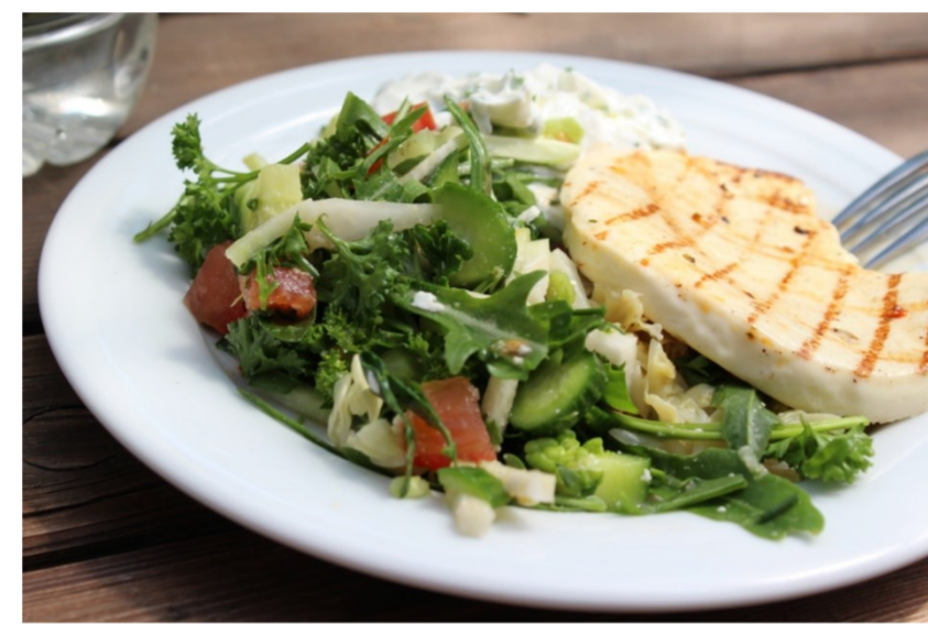
Healthy meal cooked with locally produced food