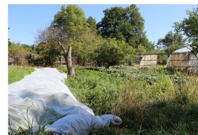
Variety of plants and ecological farming support animal diversity