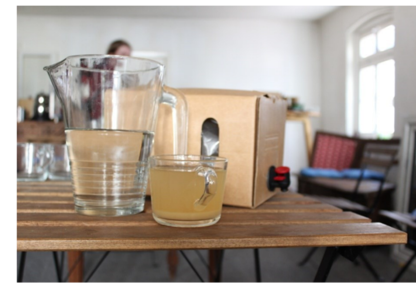
Tasting juice of a rare apple cultivar in the future coffee shop