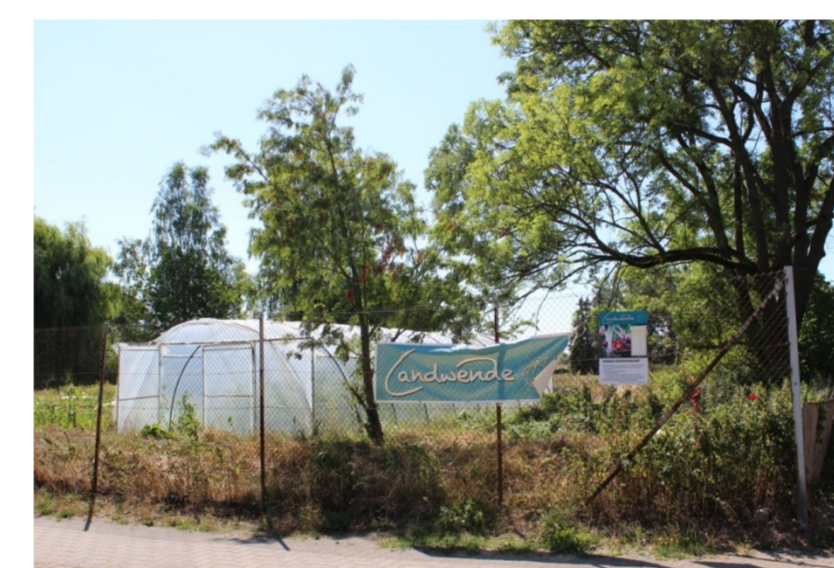
One of three garden sites in Lüchow, situated on good farming land