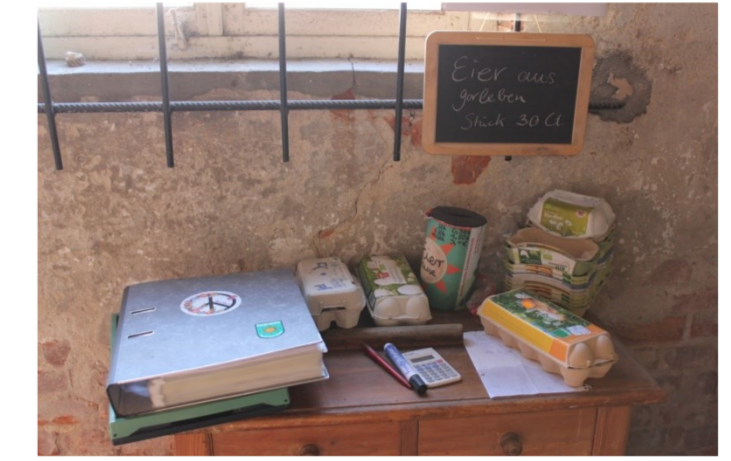
Food products of the Landwende: (honey, marmelades, eggs, sausage)