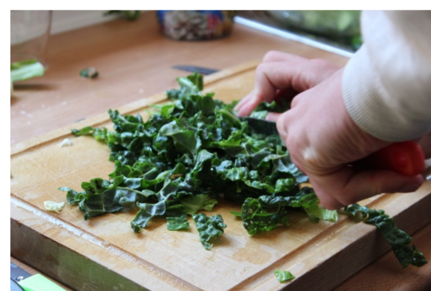
Community cooking with self harvested vegetables and herbs