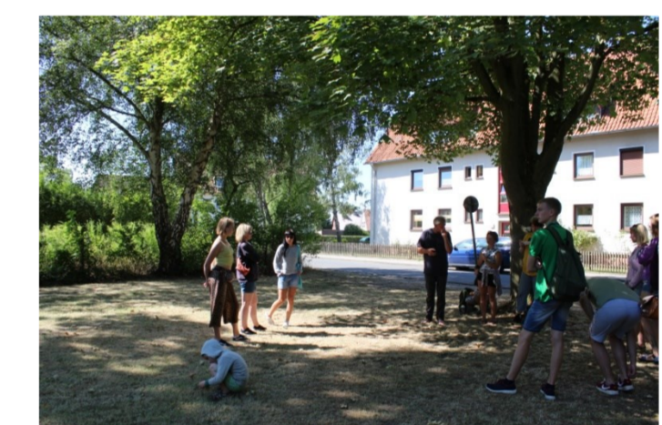
1950's: Houses in the background were build on good farmland