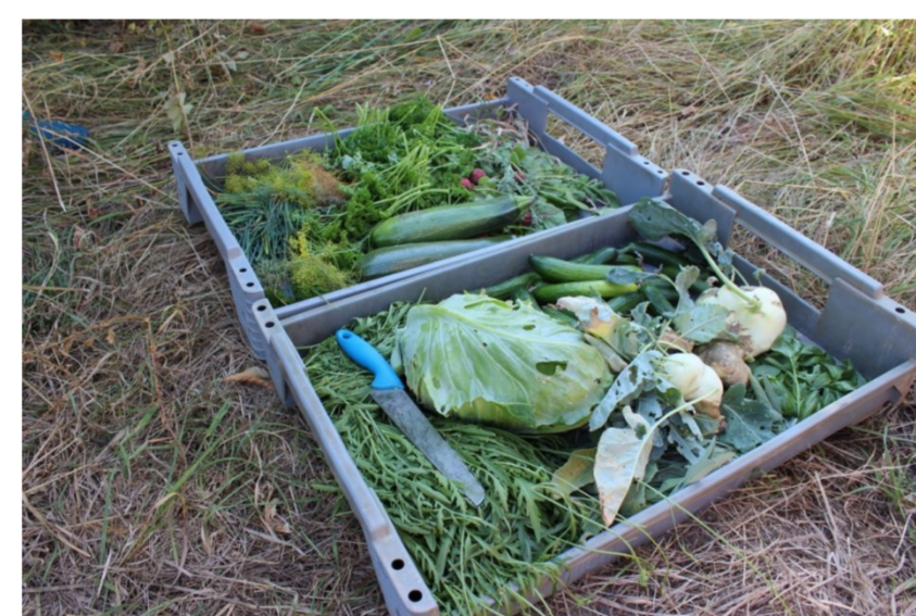
Successful harvest: Cabbages, cucumbers, herbs, and more