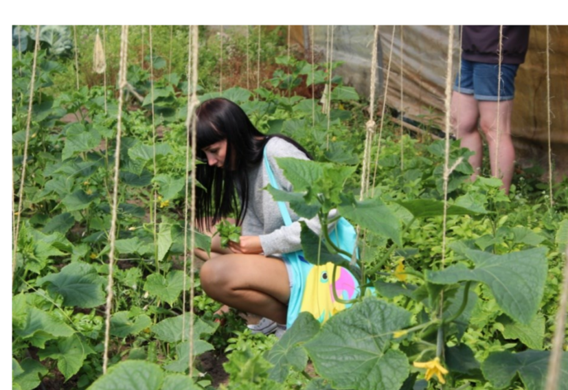
Harvesting vegetables and herbs of the season