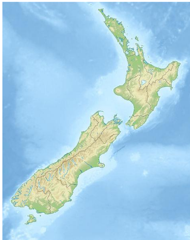
Fig. 4: New Zealand relief map (Anonymous, 2010)