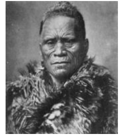
Fig. 2.: Tāwhiao, second Māori King, died 26th Aug. 1894 (Anonymous, ca. 1894)

In the 13th and 14th century New Zealand was settled by Polynesian settlers who created the Maori culture.