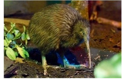
Fig. 1: A North Island Brown Kiwi at Rainbow Springs Kiwi Wildlife Park in Rotorua, North Island, New Zealand. (Anonymous, 2010)