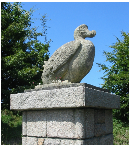
Dodos stand guard at the gates of the Durrell Wildlife Park

Durrell founded the Jersey Zoological Park (now Durrell Wildlife Park) in 1958 to house his growing collection of animals. The site for the zoo, a 16th-century manor house, Les Augres Manor, came to Durrell's notice by chance after a long and unsuccessful search for a suitable site. Durrell leased the manor and set up his zoo on the redesigned manor grounds. In the same year, Durrell undertook another, more successful expedition to South America to collect endangered species. The zoo was opened to the public in 1959 on 26 March.