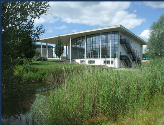
Campus der Europa-Universität Flensburg